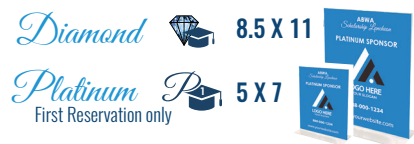
TABLE TENTS ( Double sided )